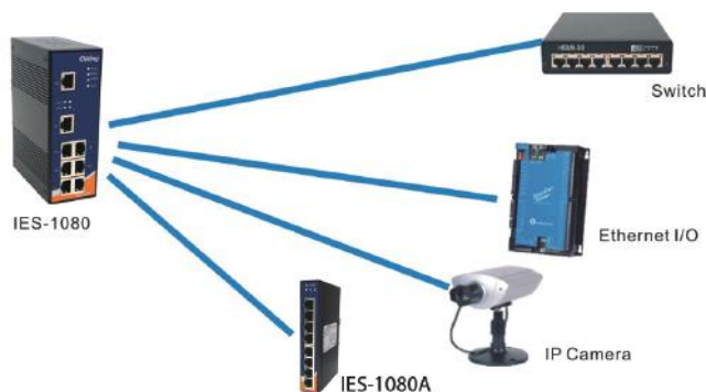
Connections of Ethernet devices

IES-1080/1062 series can be used in connecting several Ethernet devices like Ethernet I/O, IP-Camera or other Ethernet switches. In addition, there are three different power inputs to enhance its reliability, two supplied by terminal block, and one by power jack to avoid interruption caused by power down. When the primary DC power input fails, the backup power input will take over immediately to guarantee a non-stop operation.