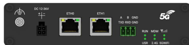
R5020L-B-5G-A30EU (PN: B098005)